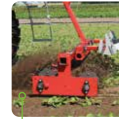
The K.U.L.T. Cage Weeder can be attached at every common Tool-Carrier