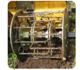
Adjustable working-elements allow with easy handling, a quick and optimal adjustment to different working and row widths