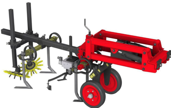
K.U.L.T.iScan parallelogramm unit

Behind the In-Row tools, finger weeders remove the soil from the weeds that have been cut out, increasing the efficiency of the weeding pass. Further on, the in-row tools can be lifted in order to use the shares at further growth stages. The intermediate row is kept weed-free via classic weeding tools. The tool set is arranged with a parallelogram directly above the row. The system is completed by a camera row guidance system with folding frames.